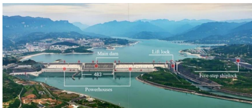
Fig 1. The structure of the TGD (unit: m) [9].

The TGD is a concrete gravity dam, known for its high level of safety and excellent earthquake resistance capacity. Concrete for the TGD is not only strong but also resistant to seepage, freezing, cracking, impact and abrasion, carbonation and erosion [9].