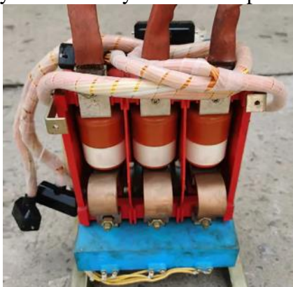
Figure 1. Vacuum circuit breaker for explosion-proof equipment in coal mine

Coal accounts for over 90% of China's fossil energy resources, making it the most stable, economical, and self-sufficient energy source available. Although new energy sources such as natural gas, nuclear power, and wind energy are developing rapidly, coal's dominant position as an energy source will not change due to the characteristics of China's energy structure and its energy security strategy. Explosion-proof equipment in coal mines is vital for underground mining operations, gas extraction, transportation, drainage, and rescue efforts. The geological conditions in China's coal mining areas are complex, characterized by dark and humid environments with high levels of flammable and explosive gases and dust. Disasters such as gas explosions, rock bursts, fires, and water hazards occur frequently. Failures in explosion-proof equipment can lead to serious electromechanical accidents and gas explosions. Therefore, the safety of explosion-proof equipment is directly related to the smooth conduct of safe production activities in coal mines. The switches used in explosion-proof equipment include vacuum contactors, vacuum circuit breakers in Figure 1, isolating switches, and other components that connect and disconnect branch devices. In case of faults, these switches can instantaneously cut off faulty branches to provide protective functions.